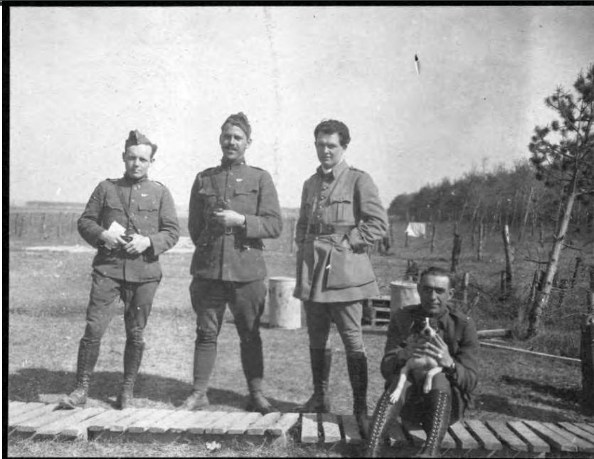
Indiana World War I soldiers with dog

On April 6, 1917, the United States officially declared war on the German Empire and entered World War I. This remains America's forgotten war, although more Americans gave their lives than in Korea and Vietnam combined. Indiana and the World War I Centennial Commis-